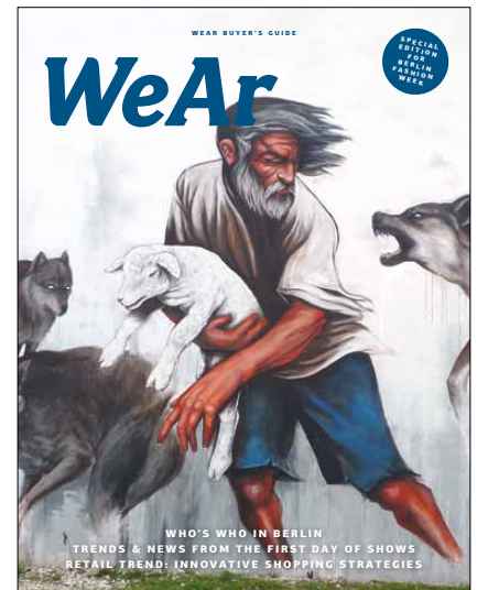
COVER EDITION 2/ 2ND DAY